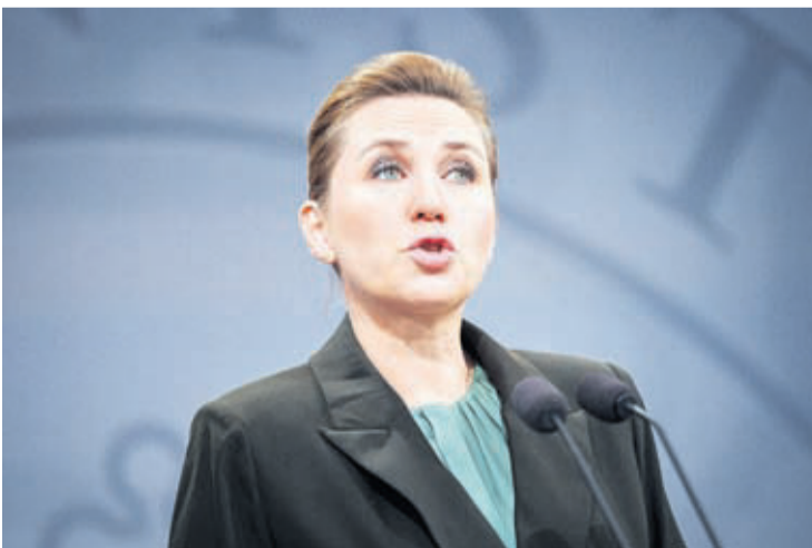
Danish Prime Minister Mette Frederiksen speaks during a press conference on strengthening the Armed Forces, at the State Ministry, Christiansborg, in Copenhagen, Wednesday, March 13, 2024.